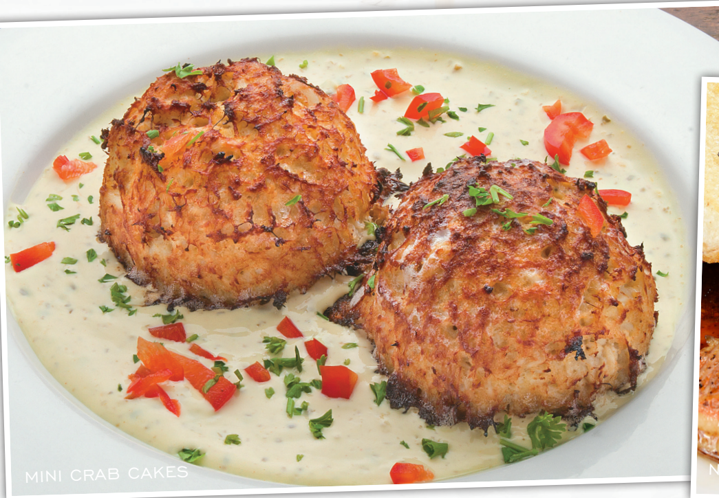
MINI CRAB CAKES

BEEF TENDERLOINS SLICED AND SERVED WITH HORSERADISH SAUCE & SPICY MUSTARD ALONG WITH ROLLS. (NOT OFFERED AS A STANDALONE OPTION, ONLY COMBINED WITH ISLAND BUFFET & HORS D' OEUVRES OPTIONS)