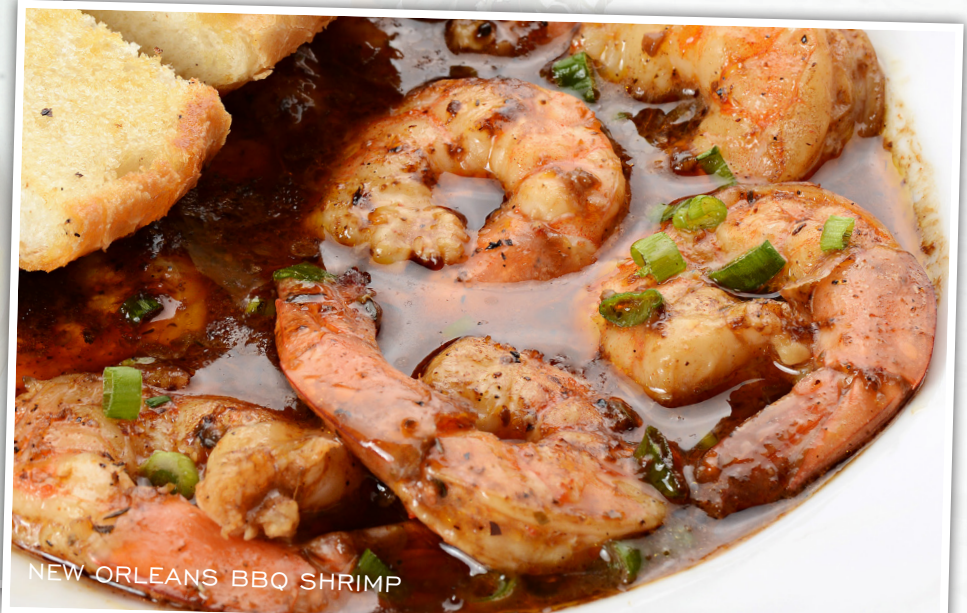
NEW ORLEANS BBQ SHRIMP